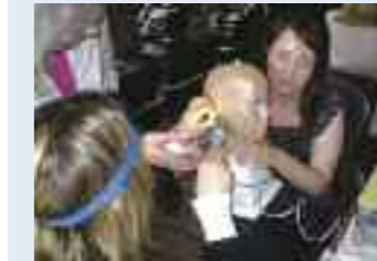
Some attendees at the "Excellence in Ear Care" workshop which took place in the River Lee Hotel in Cork.

"Excellent workshop, very informative, explained every aspect of the information given." Practice Nurse, Co Laois