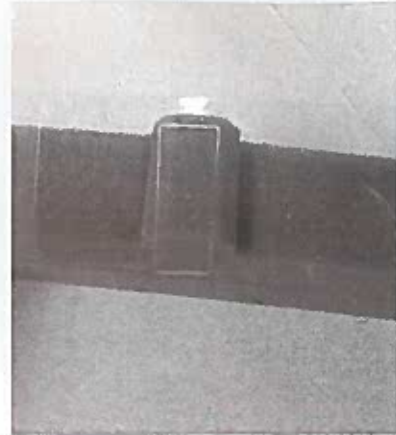
Align center hole with center tab