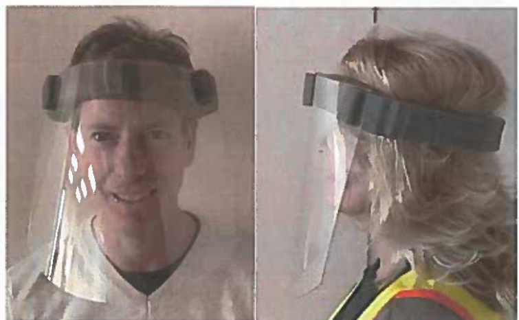
Pull foam over head with shield in front of face.

Note: One side of the plastic shield contains an antifog coating. To determine the antifog side, simply breathe on the shield.