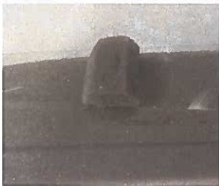
Insert tab into hole