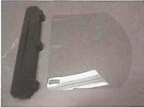
2 components: 1 foam & 1 plastic shield