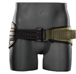
MILITARY OD GREEN /BLACK